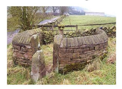
The ruins of a Hearg

So although so much of our past is lost to us, fragments survive in our place names, telling us of lost landscapes. They also introduce us to the hardy, pioneering individuals who first settled the wilderness that was Hertfordshire, itself named for a ford frequented by stags. Finally, they show us something of the life that was lived, where smoke rose from the heathen temple atop Harrow on the Hill, and hunters moved stealthily through the forests of Watford.