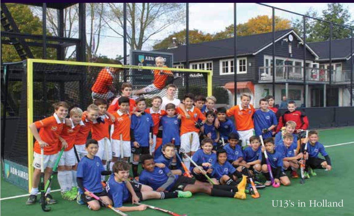
U13's in Holland

The U13's have an annual tour to Holland.